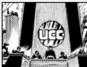
UCC General Committee in session

After the 13 Hour War concluded, the United Nations came under attack for its failure to prevent the mass devastation. The UN disbanded, and like a phoenix rising from the ashes, the United Corporate Council (or UCC) appeared, stepping in to