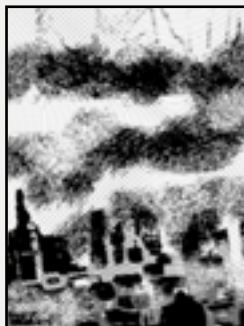
Ground Zero 11 minutes after the attack- staff photo

In 2008, a group of renegade Native Americans released a virulent biochemical weapon in the heart of Manhattan, leading to the death of nearly eight million people. In what seems the final blow in a war that was begun with the colonization of America, a second-hand Chinese plague bomb spread a toxic virus that turned the streets of NYC into a vast tomb, which scientists say will be unlivable for at least seventy years. The group, known as the Ghost Dancers, led by activist William Blackhorse, claimed that U.S. corporations and the government had been storing nuclear waste and lethal chemicals on Indian reservations, causing cancer and disease, and culminating with the Deer River meltdown. The death toll from the bombing is still being tallied. Blackhorse and his group were rumored to have died when the bomb was set off, but this was never confirmed, and rumors persist that the Ghost Dancers continue to menace society.